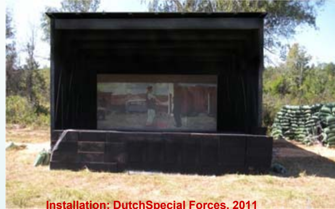
Installation: DutchSpecial Forces, 2011