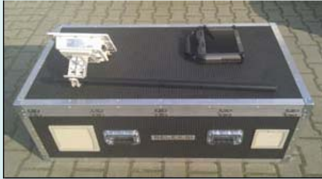
Measures: 123x70x47cm Weight: ca. 56Kg