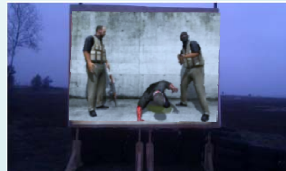
Installation freistehende Leinwand: TrpÜbPI Munster, 2011