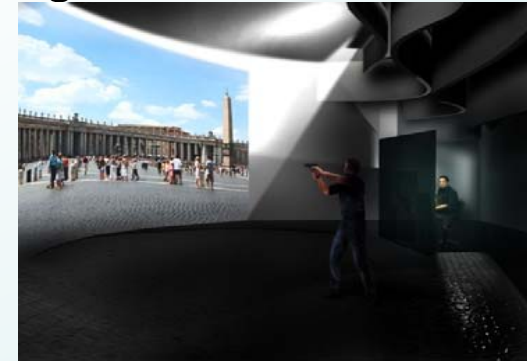
A ROOM IN A BUILDING

The system can be configured with several screens and projectors in order to obtain a full immersive environment. The system is comprehensive of auxiliary equipment such as dedicated teacher console, HVAC equipment, secure controlled access, secure weapons cabinet, etc..