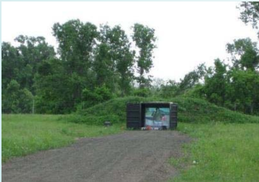
Installation Seecontainer: Bundesheer, 2011